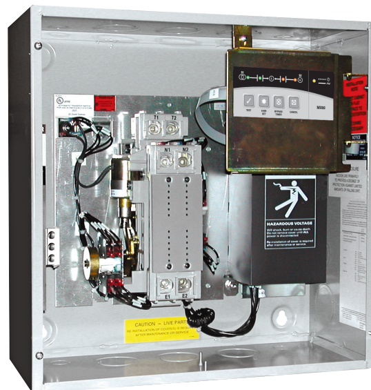
Zenith ZTX Series Small Frame Residential, Commercial & Light Industrial Switch with LED Control Panel (cover removed)

All time delays are fixed (non-adjustable).