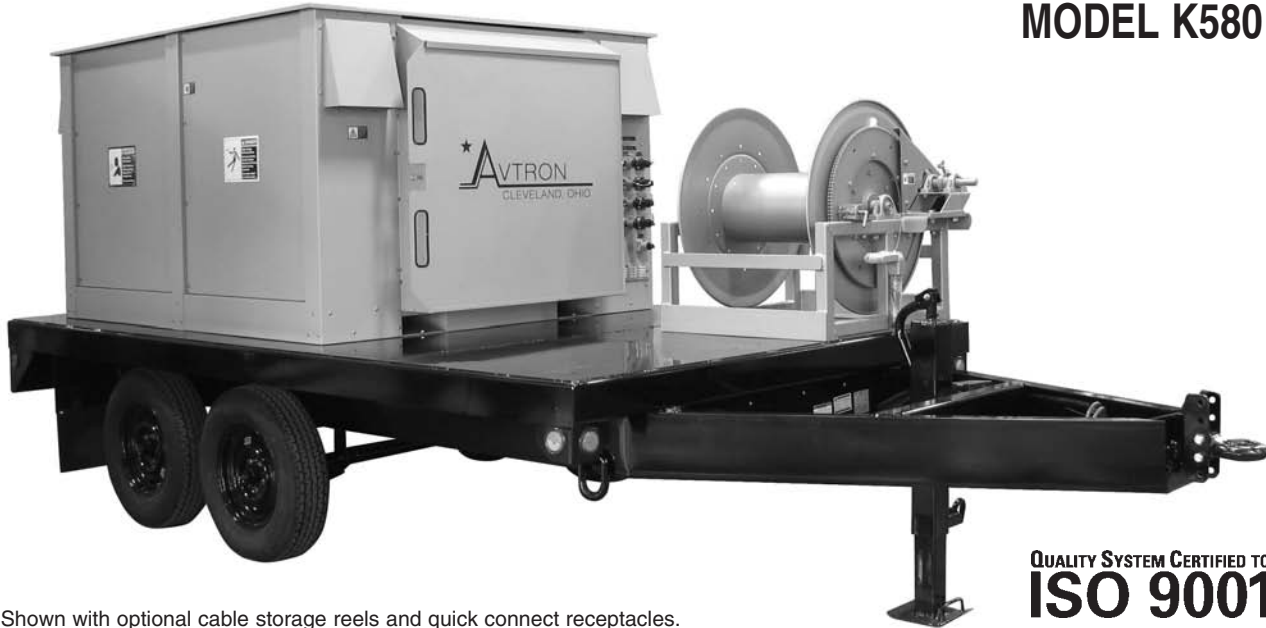
Shown with optional cable storage reels and quick connect receptacles.